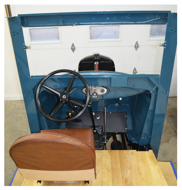
The bus body will be worked on while it is on the work frame.